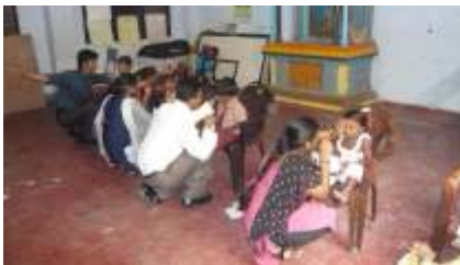
Optometrists performing vision screening in a school.

ESO joins hands with LIONS club EDEN for vision screening of the primary school children of the 10 zones of the Chennai Corporation. Zone 1 was started on 18th Aug 2010 and nine schools got the vision screening done as the first phase in four days time. Similar models could be evolved for the rest of the zones in Chennai and other districts of Tamil Nadu. Such projects will definitely aim to reduce the burden of avoidable blindness in the country.