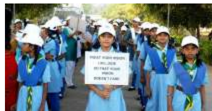
School children rally during an Eye care awareness program

Emphasizing primary eye care concepts by walk, rally or human chain and competitions is also one of the strategies followed. Competitions make the participants remember the facts on eye care for longer because of their involvement. Various innovative ways of competitions were conducted during many occasions like World Sight Day, World Glaucoma Day and prizes were distributed.