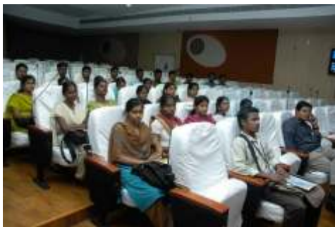
Vision Ambassador's training

Nearly 80 vision ambassadors were trained for doing the basic vision screening during the year 2009-10. The ambassadors include the schools and college students and the teachers.