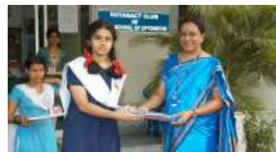
Student receiving award during the World Sight Day celebration